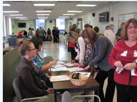
Seventh Judicial District employees talking to Benefit Representatives and picking up materials.