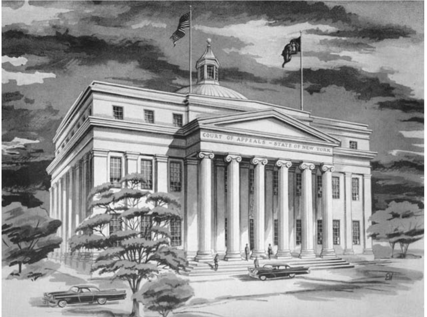
COURT OF APPEALS HALL TODAY

"The Rededication of the Court of Appeals"